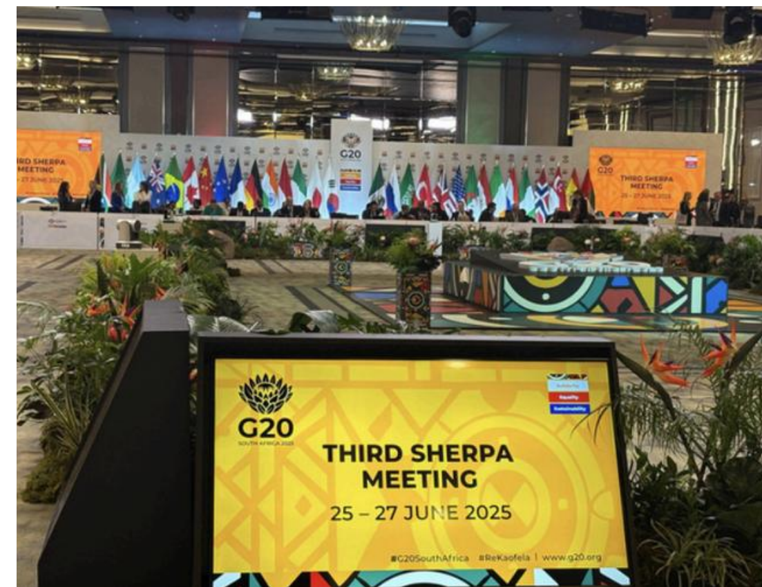
3rd Sherpa Meeting, Sun City, 26 June 2025