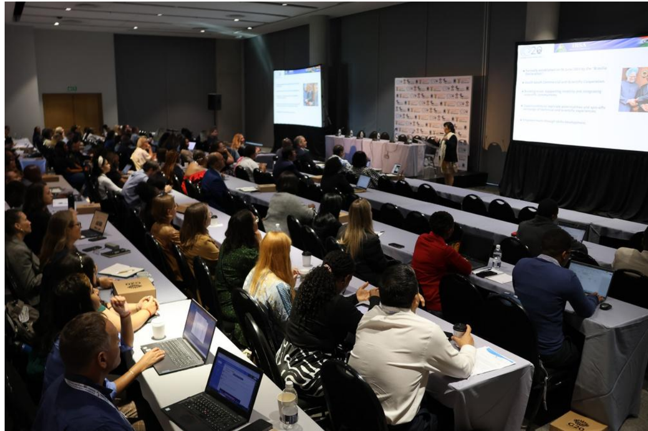
Ocean20 South Africa Launch, Cape Town, 2 April 2025