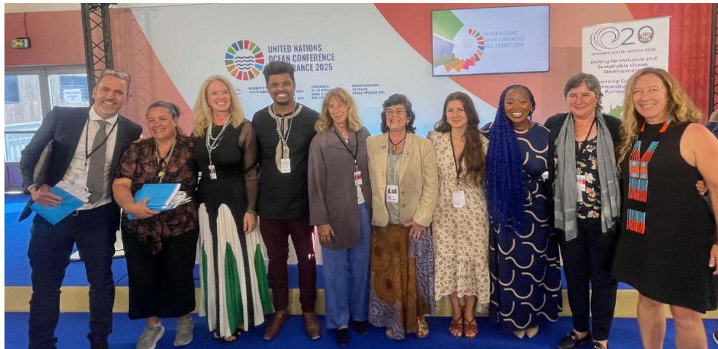
United Nations Ocean Conference, Nice, 9 June 2025