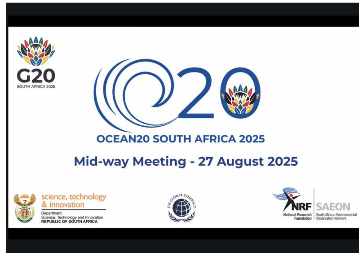
Ocean20 Mid-way Meeting, Online, 27 August 2025,