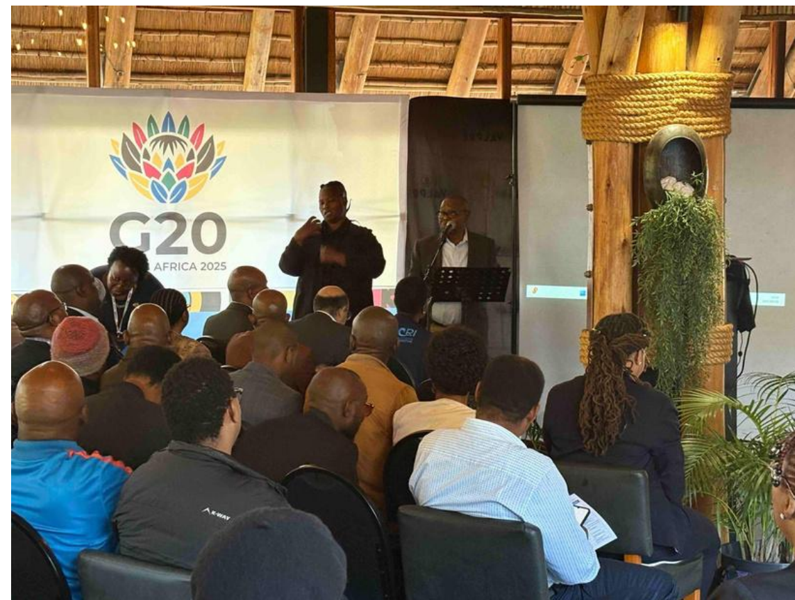
Taking the Oceans Inland, Mbombela, 26-27 May 2025